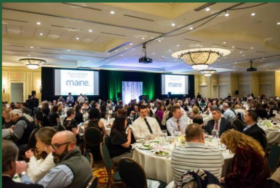
We were thrilled to welcome around 400 guests for this powerful evening.

Thanks to our many guest and supporters, we met the goal of $300,000 and sponsorship of 250 of our 500 youth.