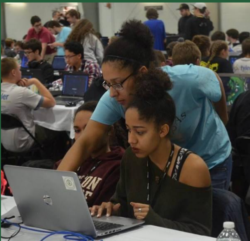
One of our CSC Thomas Cup team members receives guidance from Thomas College staff.

We're committed to providing opportunities for our youth all year long, year after year!